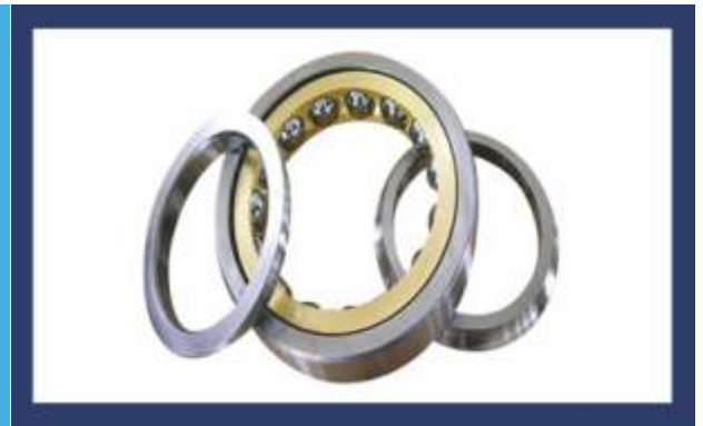
FOUR POINT BALL BEARING