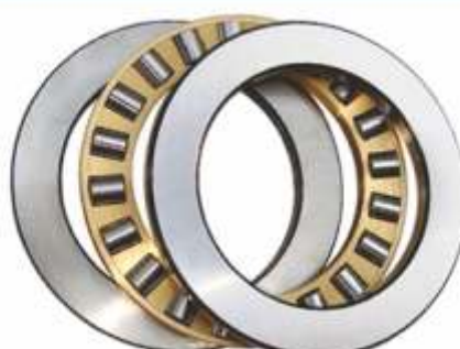
CYLINDRICAL THRUST BEARING