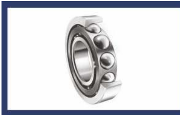
ANGULAR CONTACT BEARING