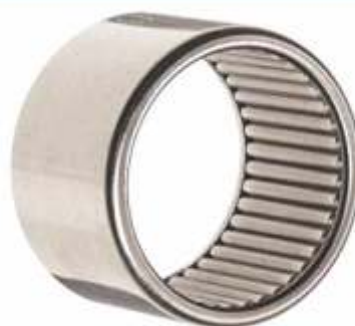
FULL COMPLEMENT BEARING