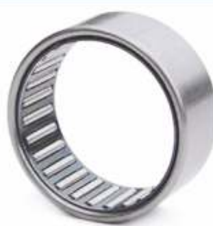
NEEDLE ROLLER BEARING