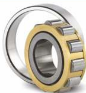
CYLINDRICAL ROLLER BEARING