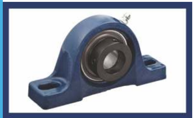
PILLOW BLOCK BEARING