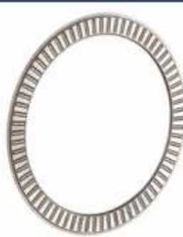
NEEDLE THRUST BEARING