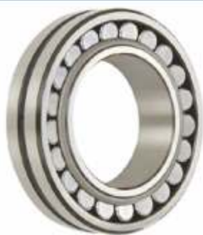
SPHERICAL ROLLER BEARING