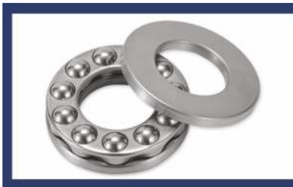
BALL THRUST BEARING