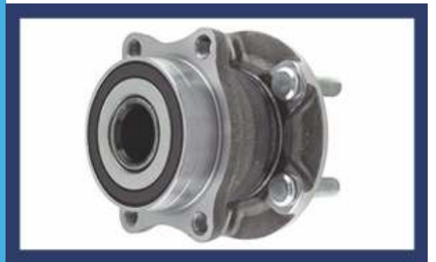
WHEEL HUB UNITS