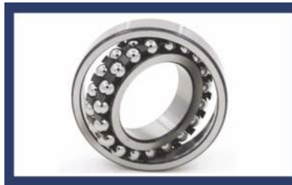
SELF ALIGNING BALL BEARING