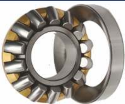
SPHERICAL THRUST BEARING