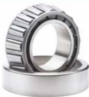
TAPER ROLLER BEARING